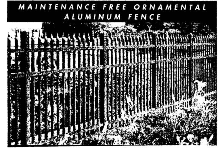
MAINTENANCE FREE ORNAMENTAL ALUMINUM FENCE