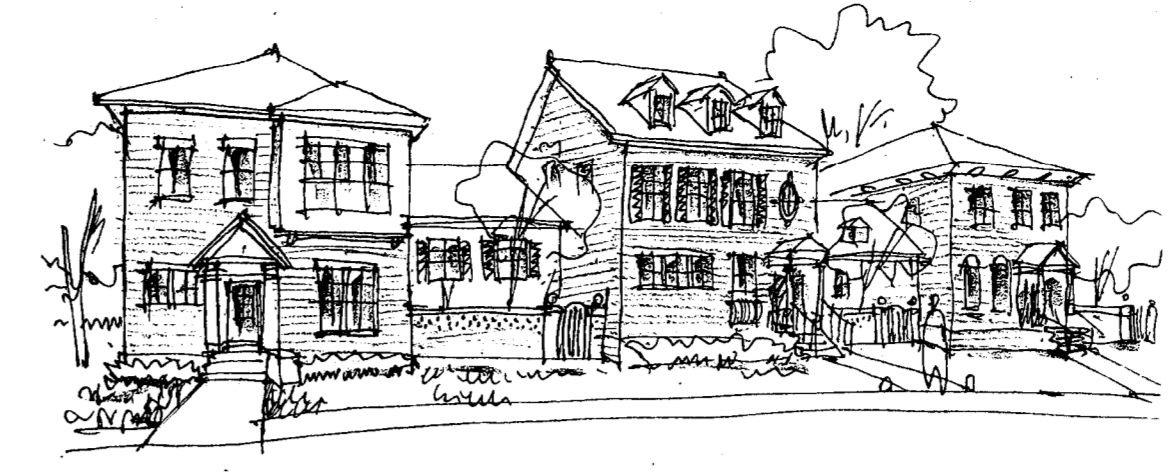
ELEVATION OF TOWNHOMES FACING WALLACE RD.