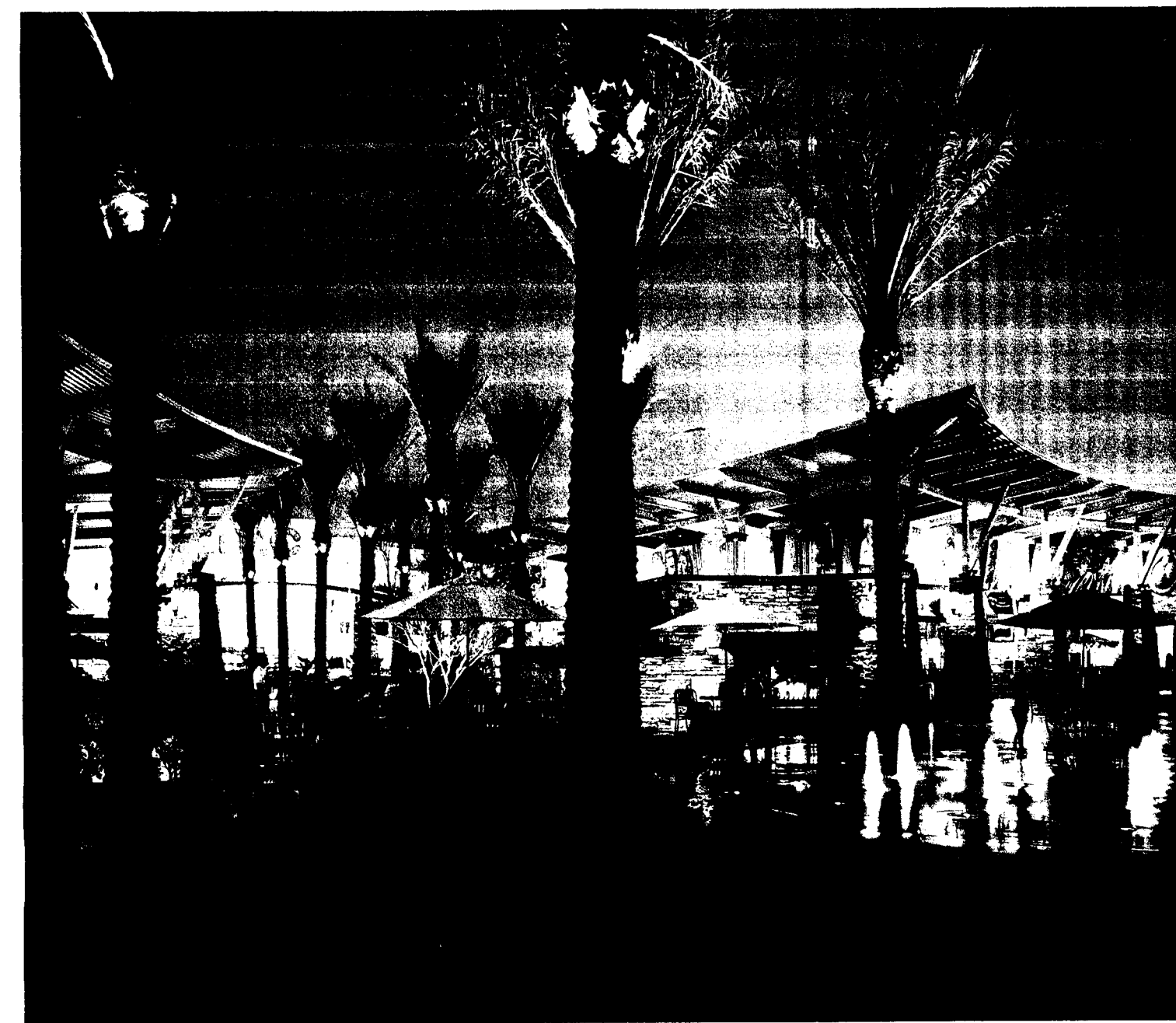
Example of Projected Canopy Type