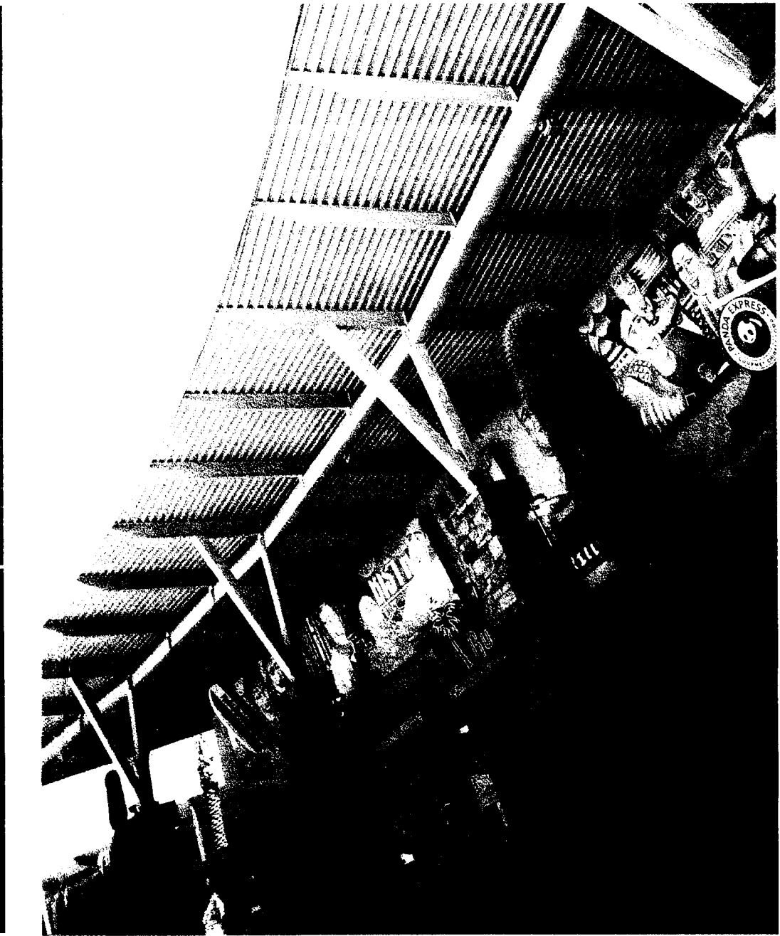
Example of Projected Canopy Type