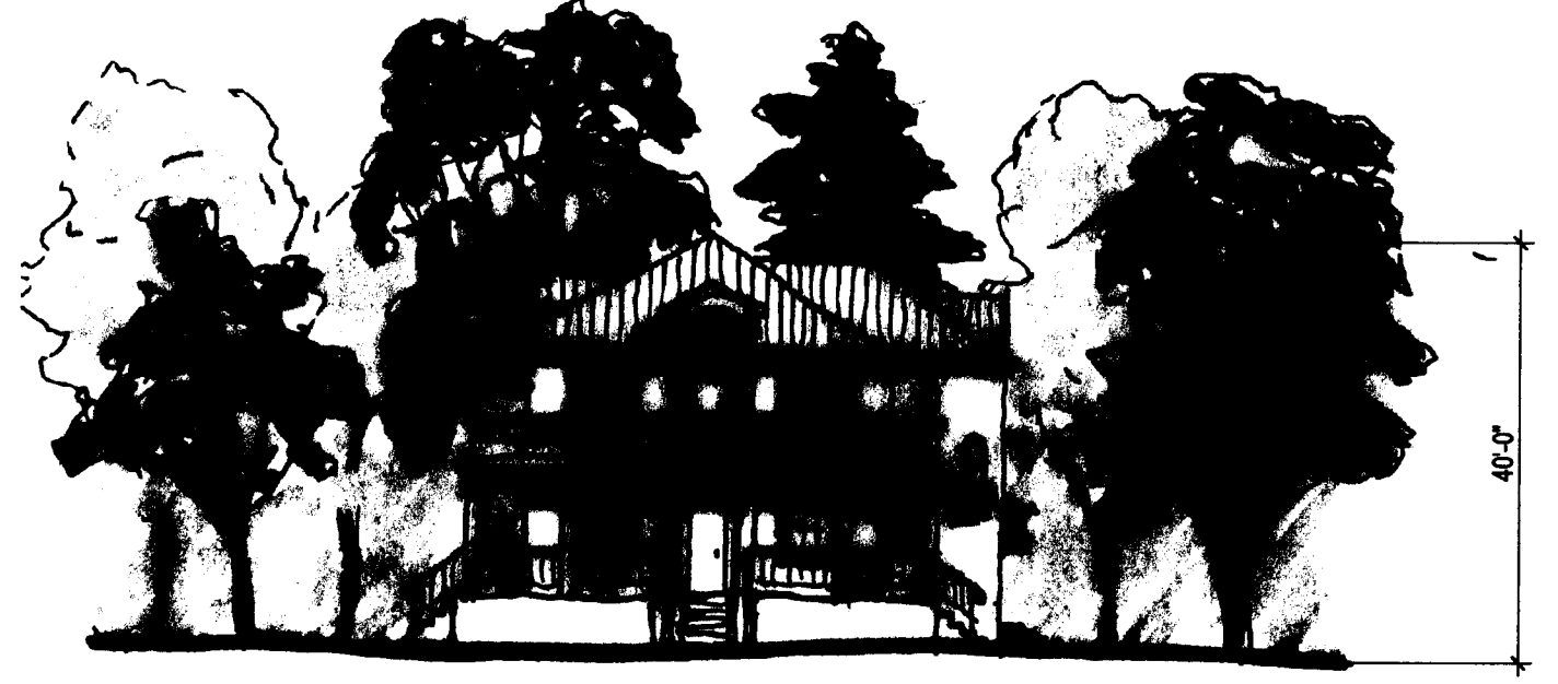
3 MEETING CENTER SOUTH ELEVATION A.1.1 1" = 20'-0"