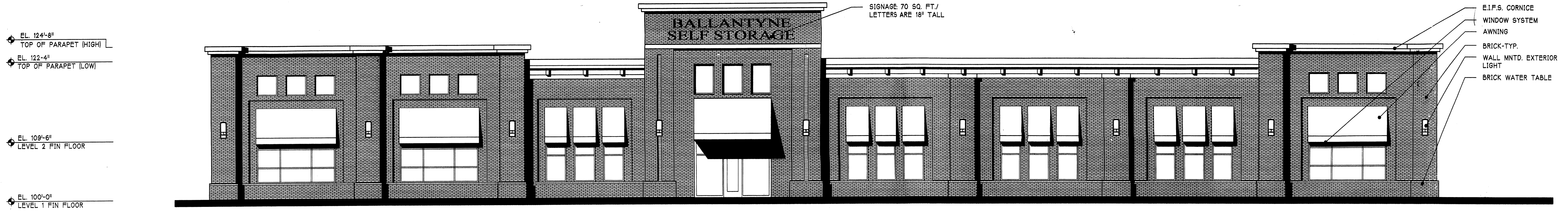
FRONT ELEVATION SCALE: 1/8" = 1'-0"

EL. 124'-8" TOP OF PARAPET (HIGH) EL. 122'-4" TOP OF PARAPET (LOW) EL. 109'-6" LEVEL 2 FIN FLOOR EL. 100'-0" LEVEL 1 FIN FLOOR