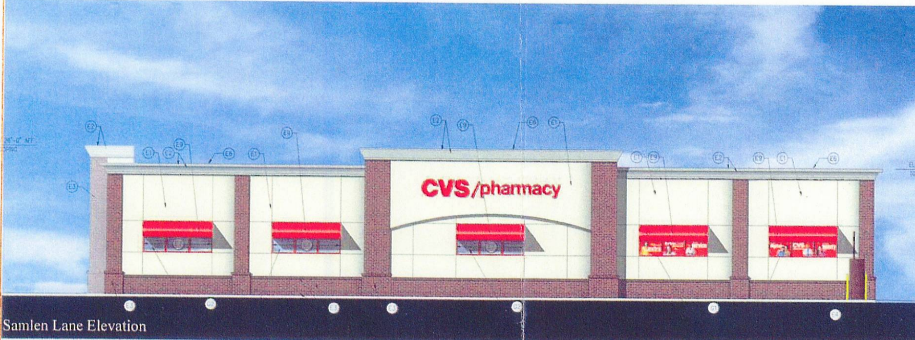
Samlen Lane Elevation