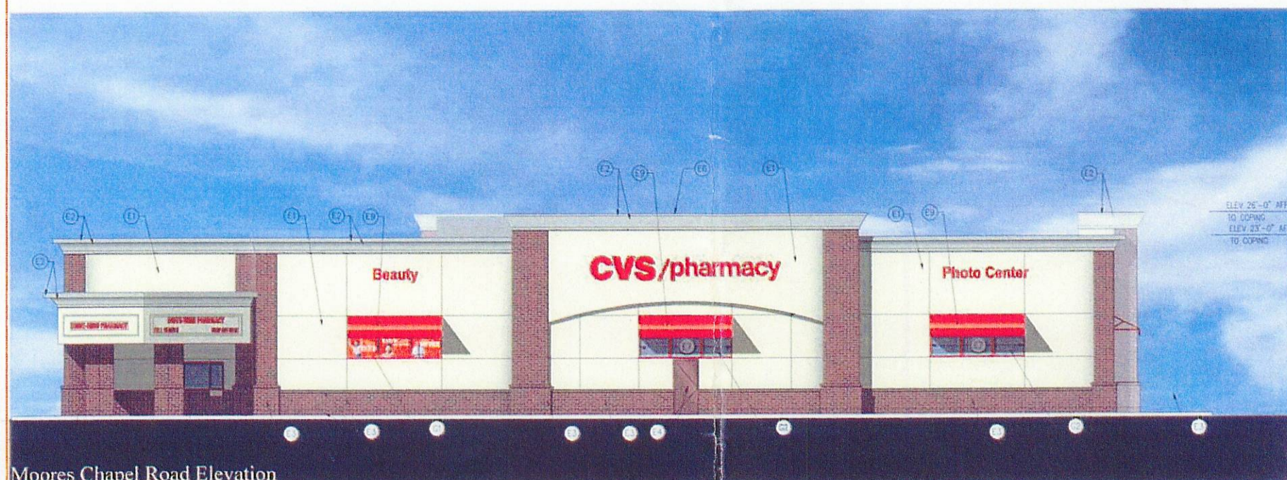
Moore's Chapel Road Elevation