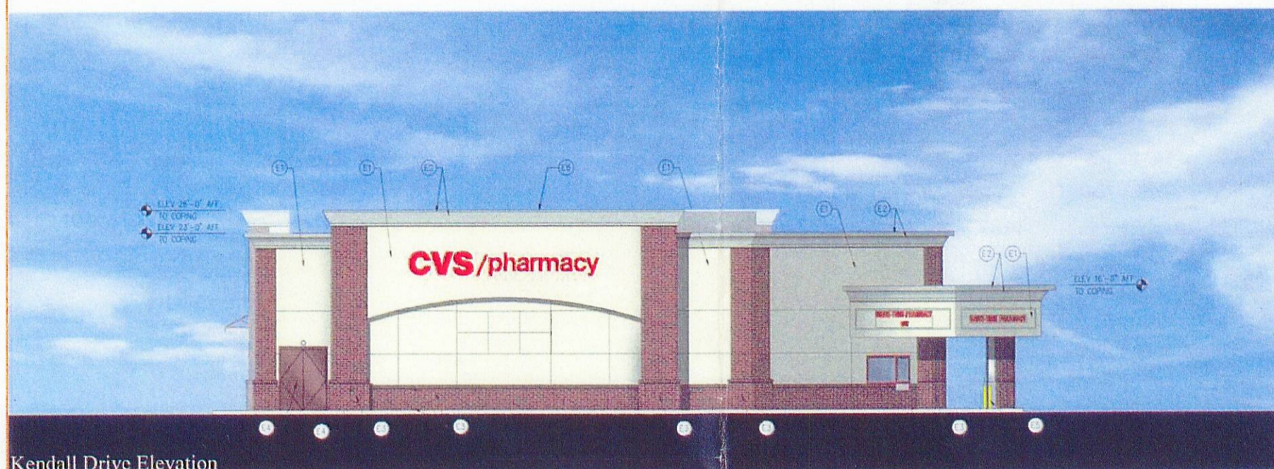
Kendall Drive Elevation