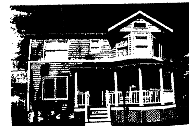
Example of proposed detached homes along Herrin Avenue.