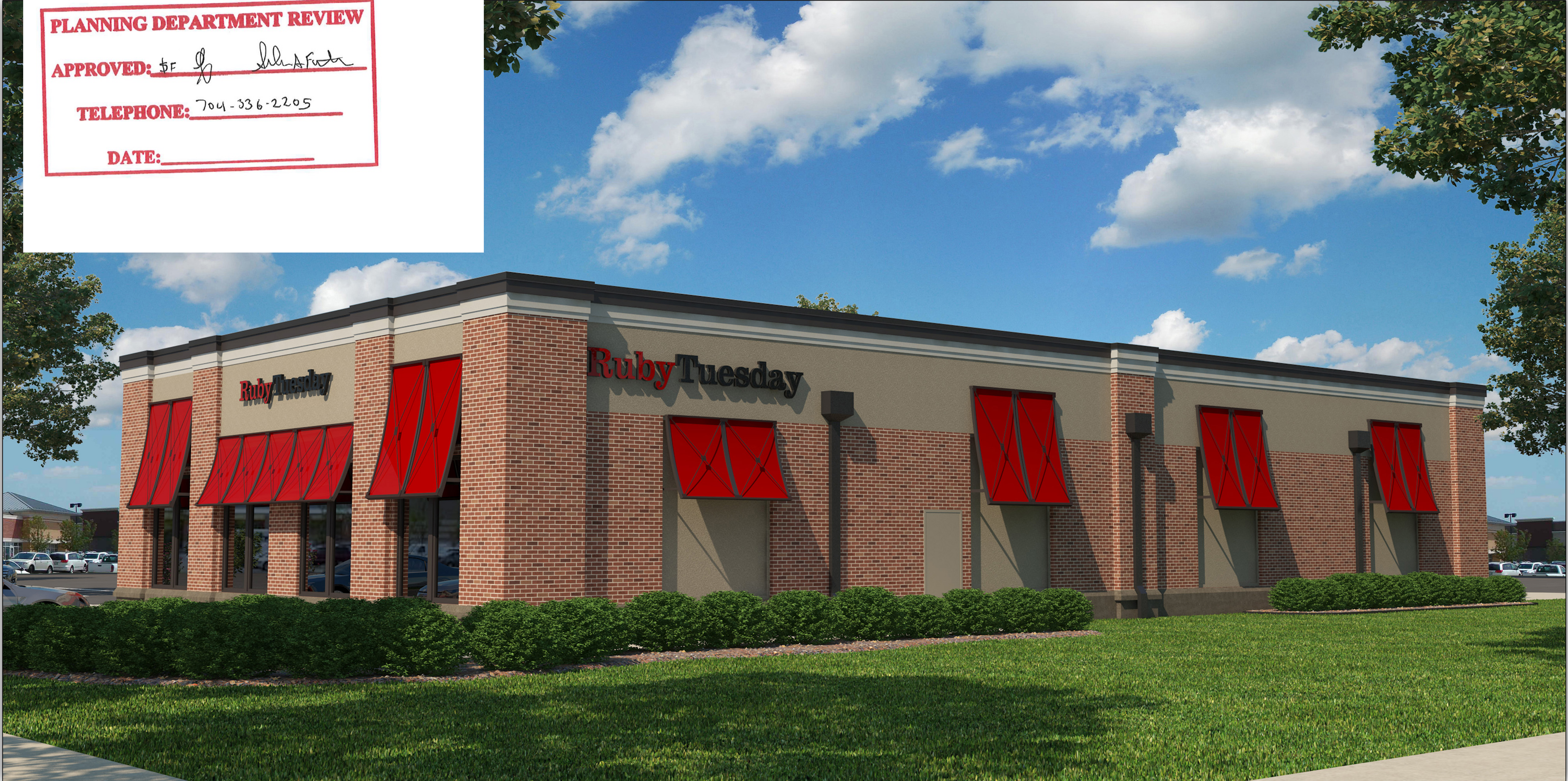
C: Southwest Elevation