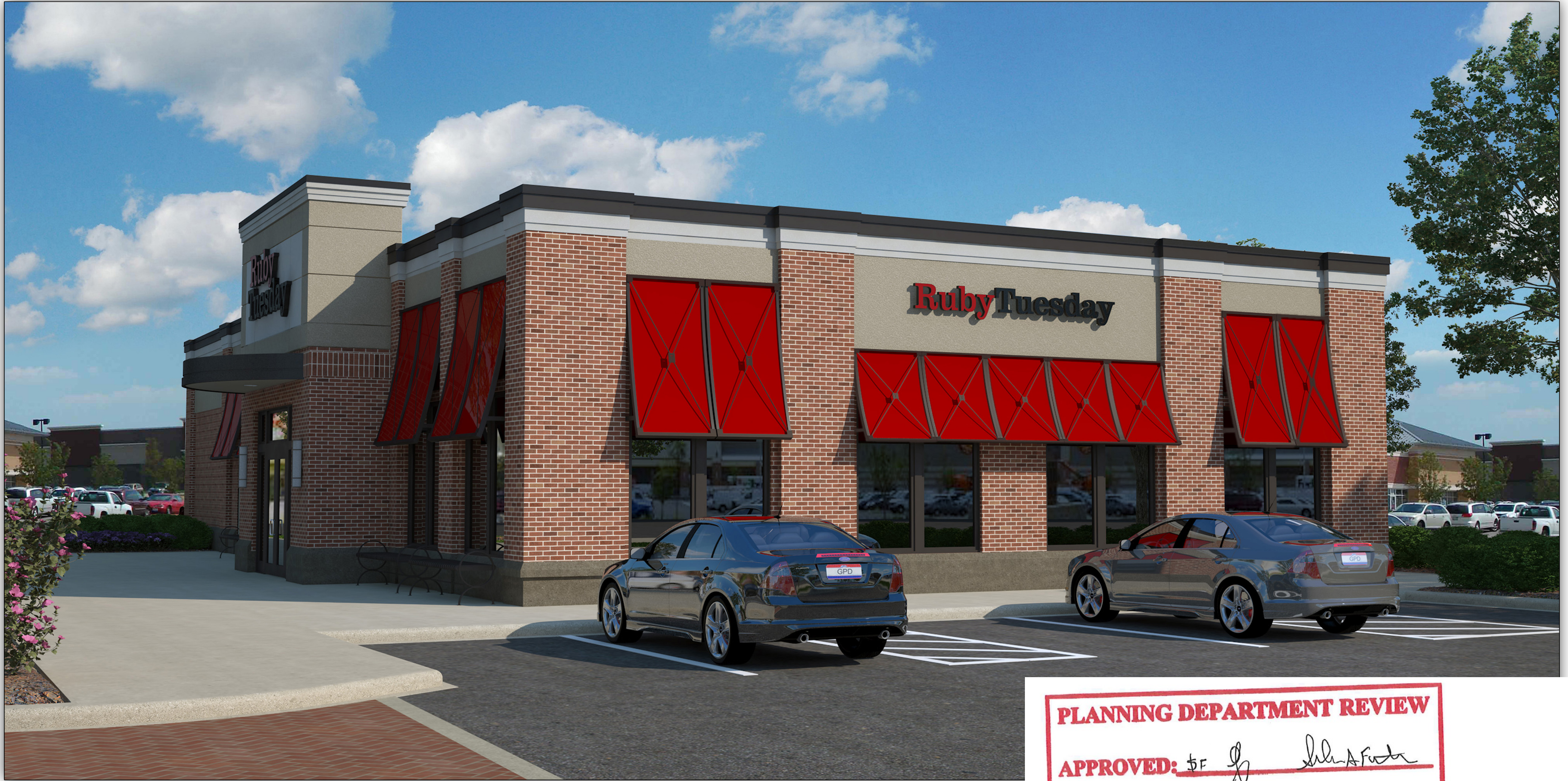
B: West Elevation