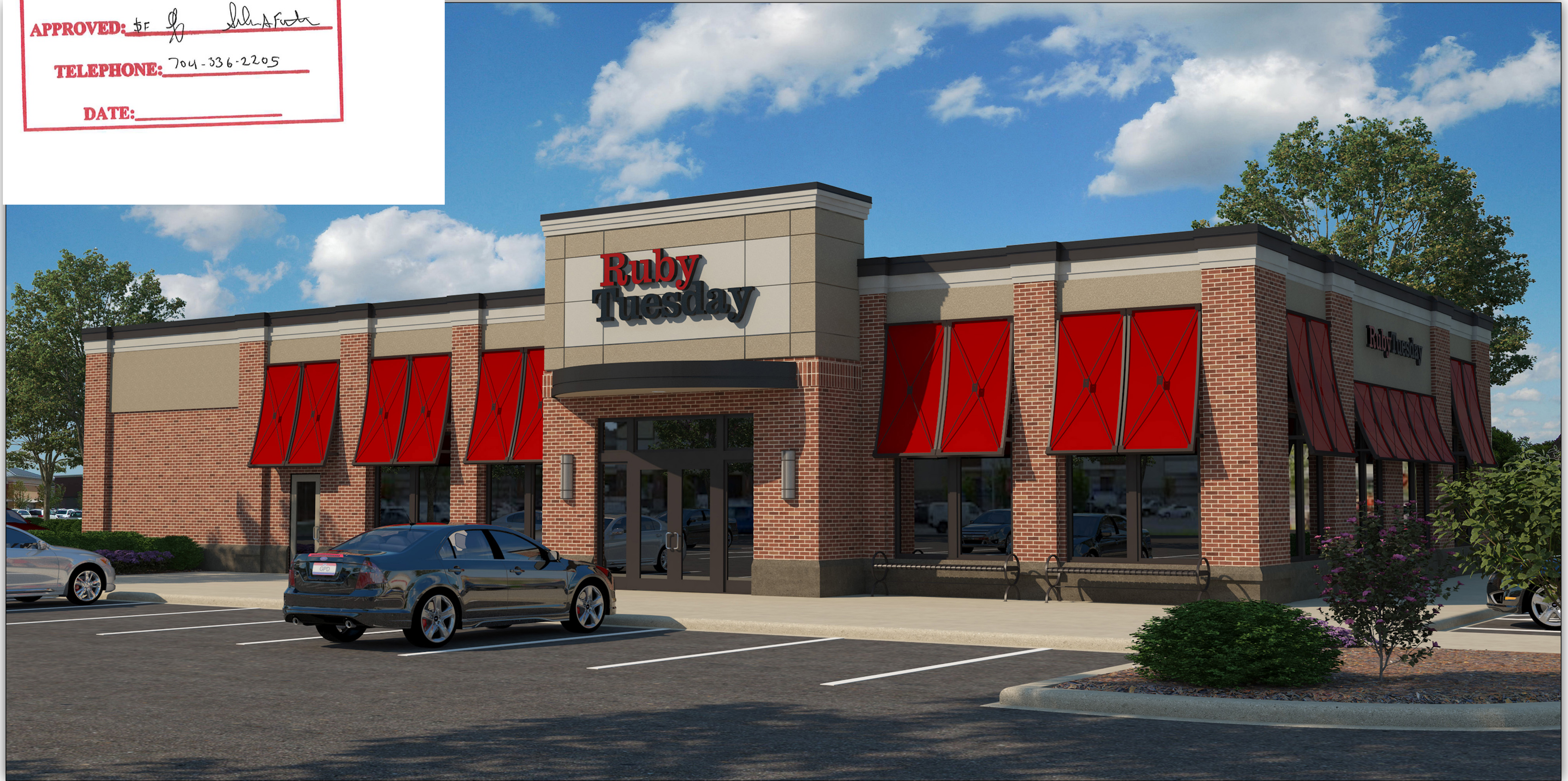
A: Northwest Elevation