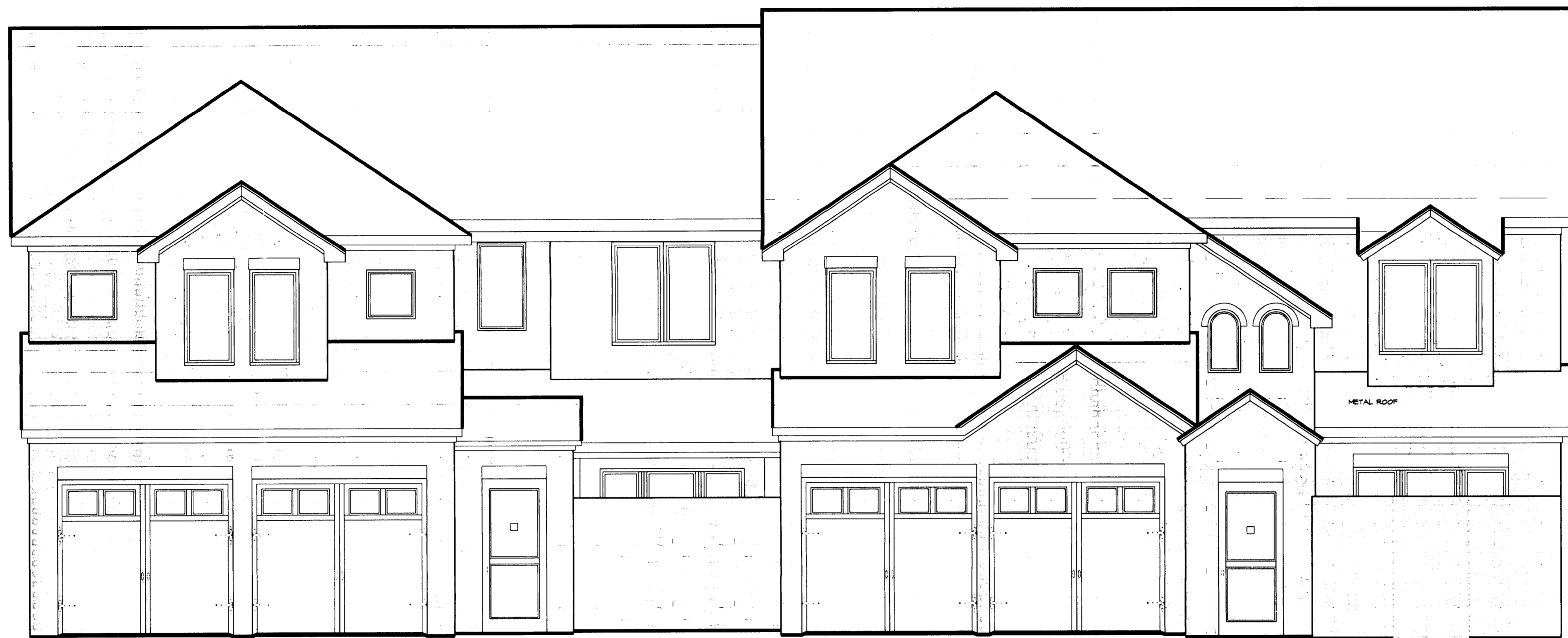
FRONT VIEW UNIT D