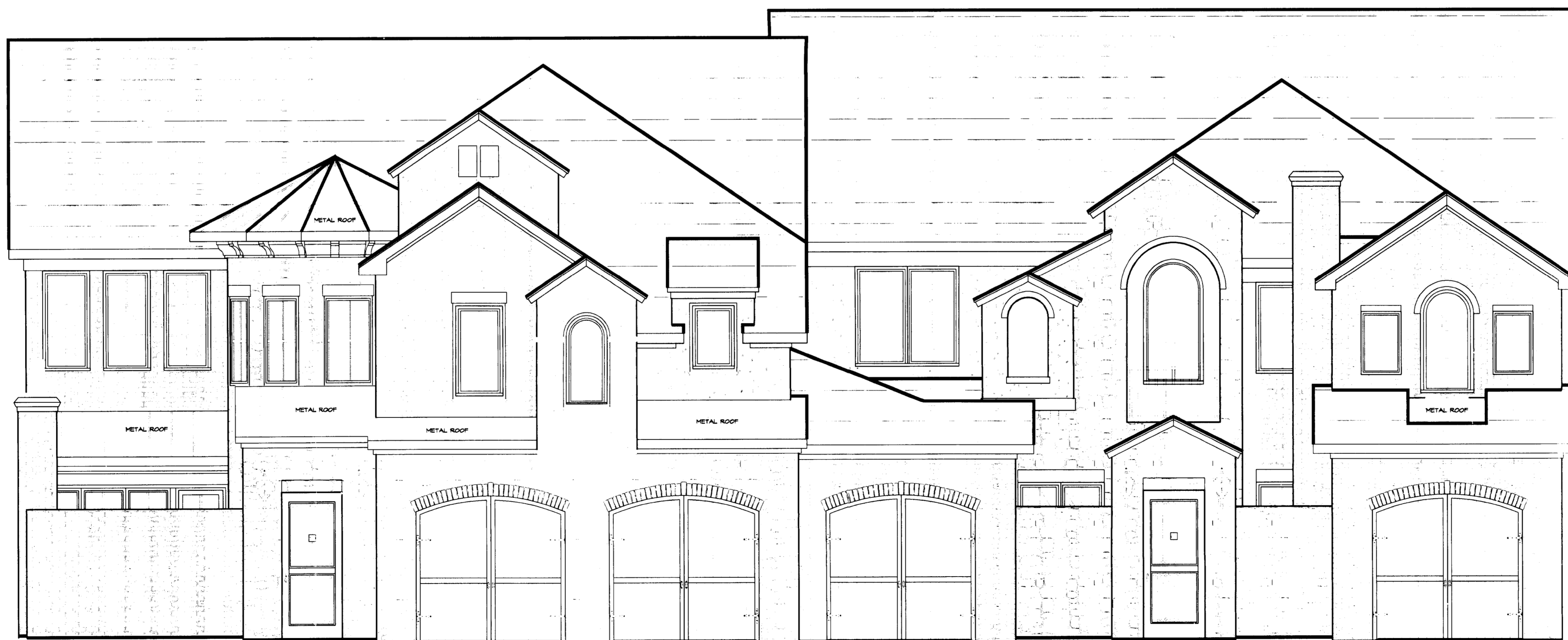
FRONT VIEW UNIT A