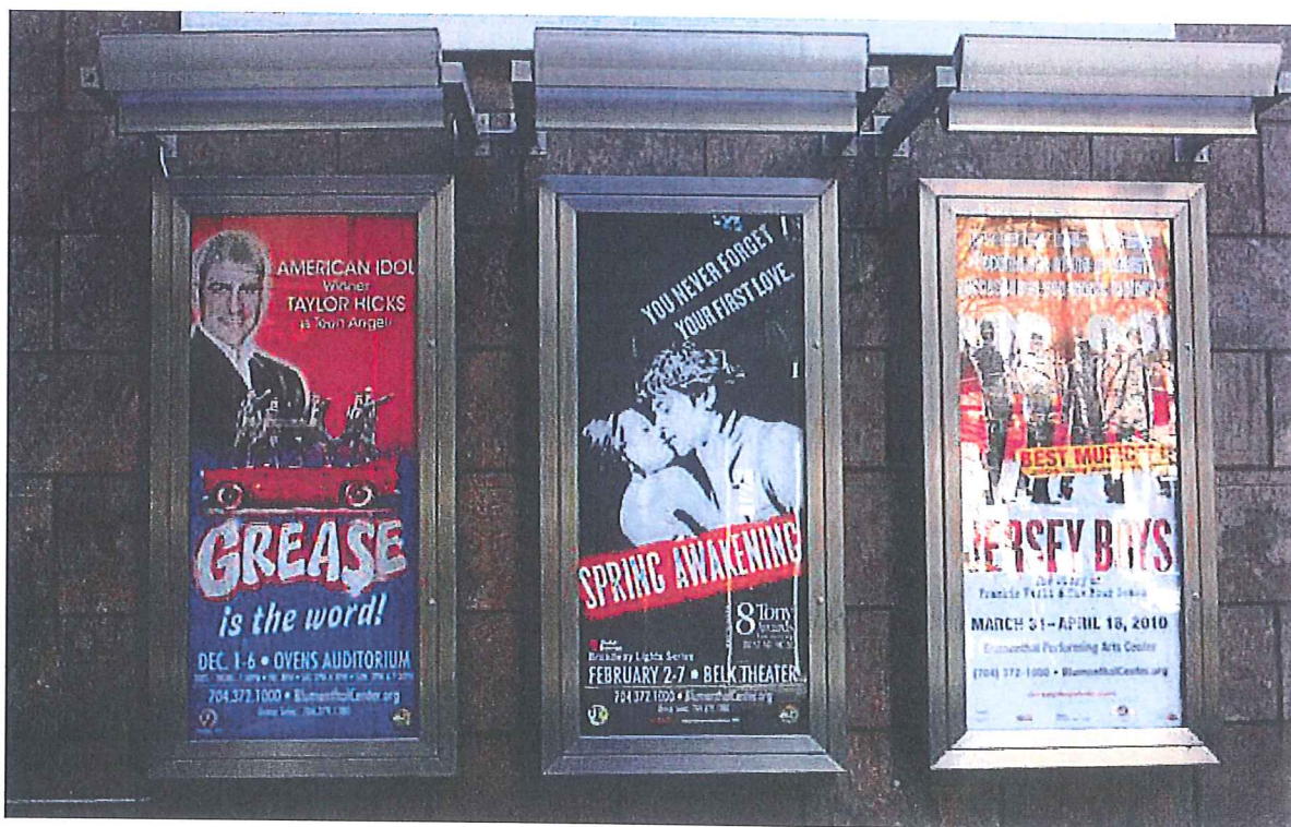
Example of bulletin boards