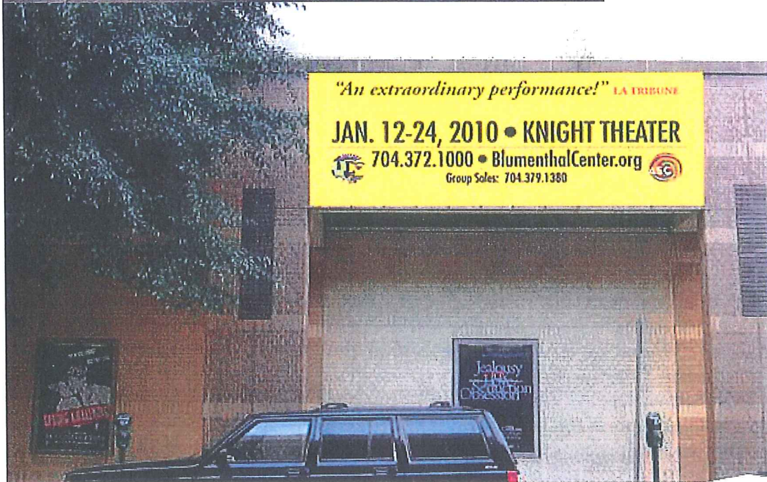
Example of banner