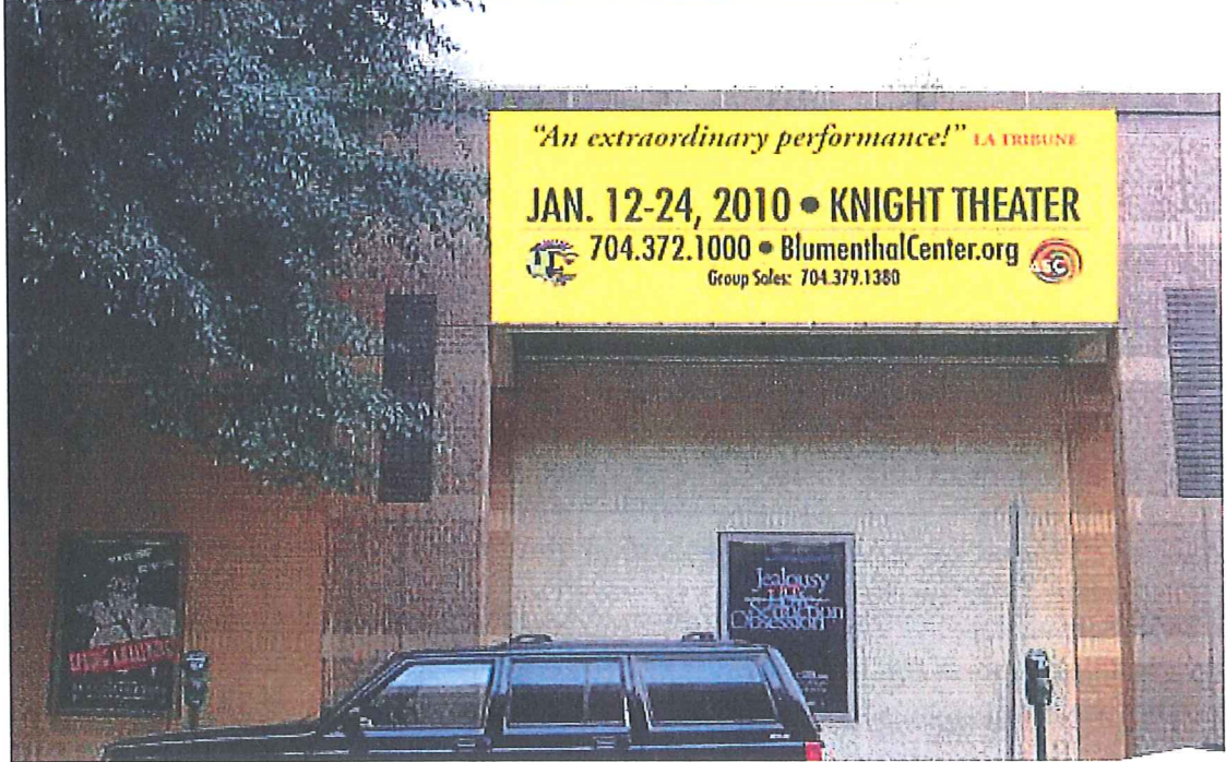
Example of banner