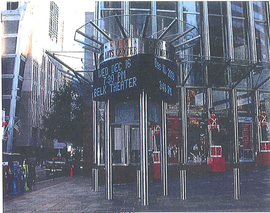
Example of LED screen