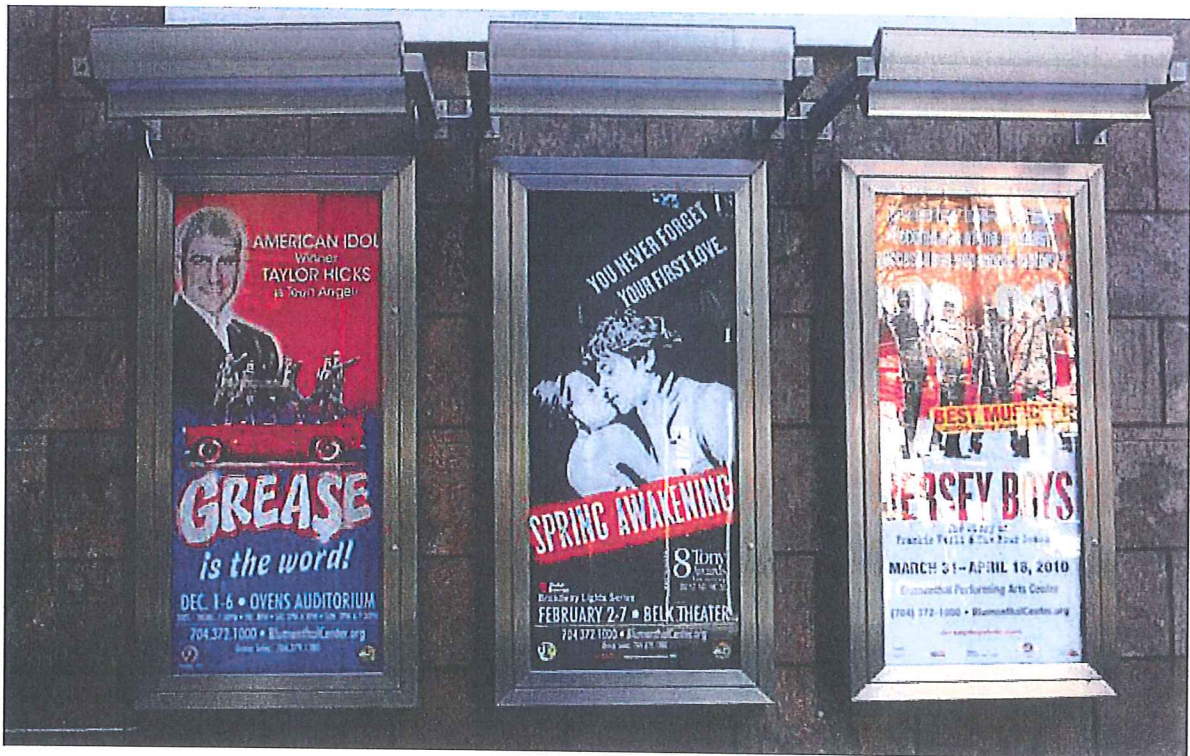
Example of bulletin boards