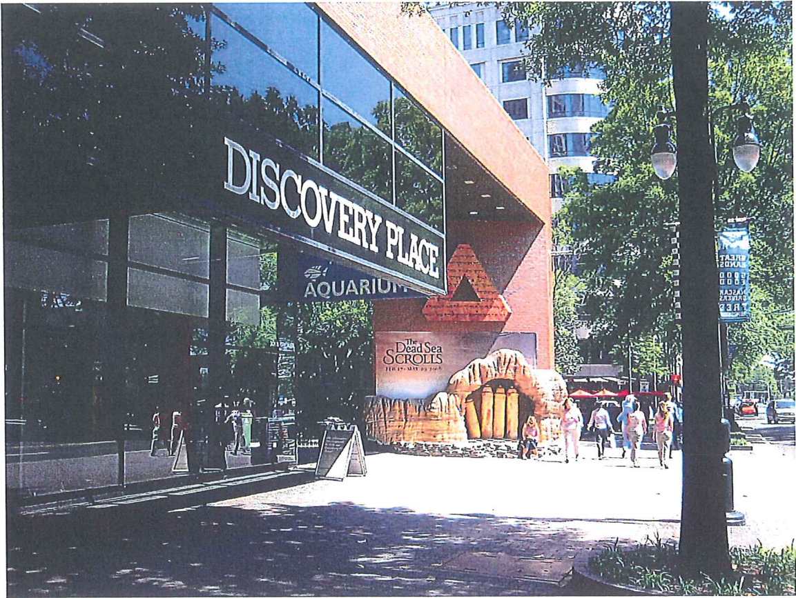
Example of wall signage