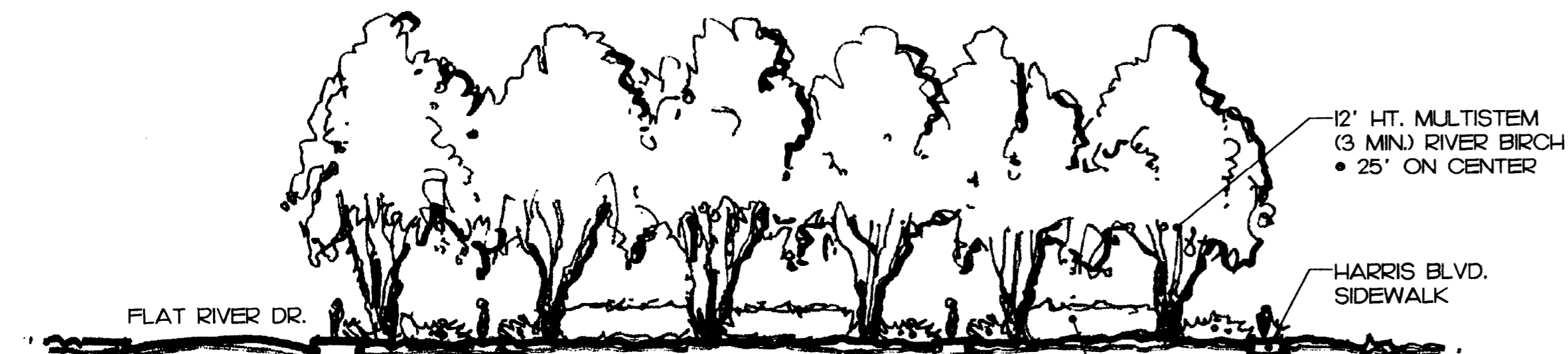
ELEVATION A. LANDSCAPE SCREEN SCALE: 1"=20'

Tax Parcel #: Portion of 047-131-85 & 047-131-55 Total SPA Area: 0.54 Acres Existing Zoning: MUDD-O Proposed Zoning: MUDD-O (SPA) Proposed use: Retail Allowed Square Footage: 8,600 Gross Square Feet Setbacks: 50' Building and Parking Setback (W.T. Harris Boulevard) 0' Side Yard Setback