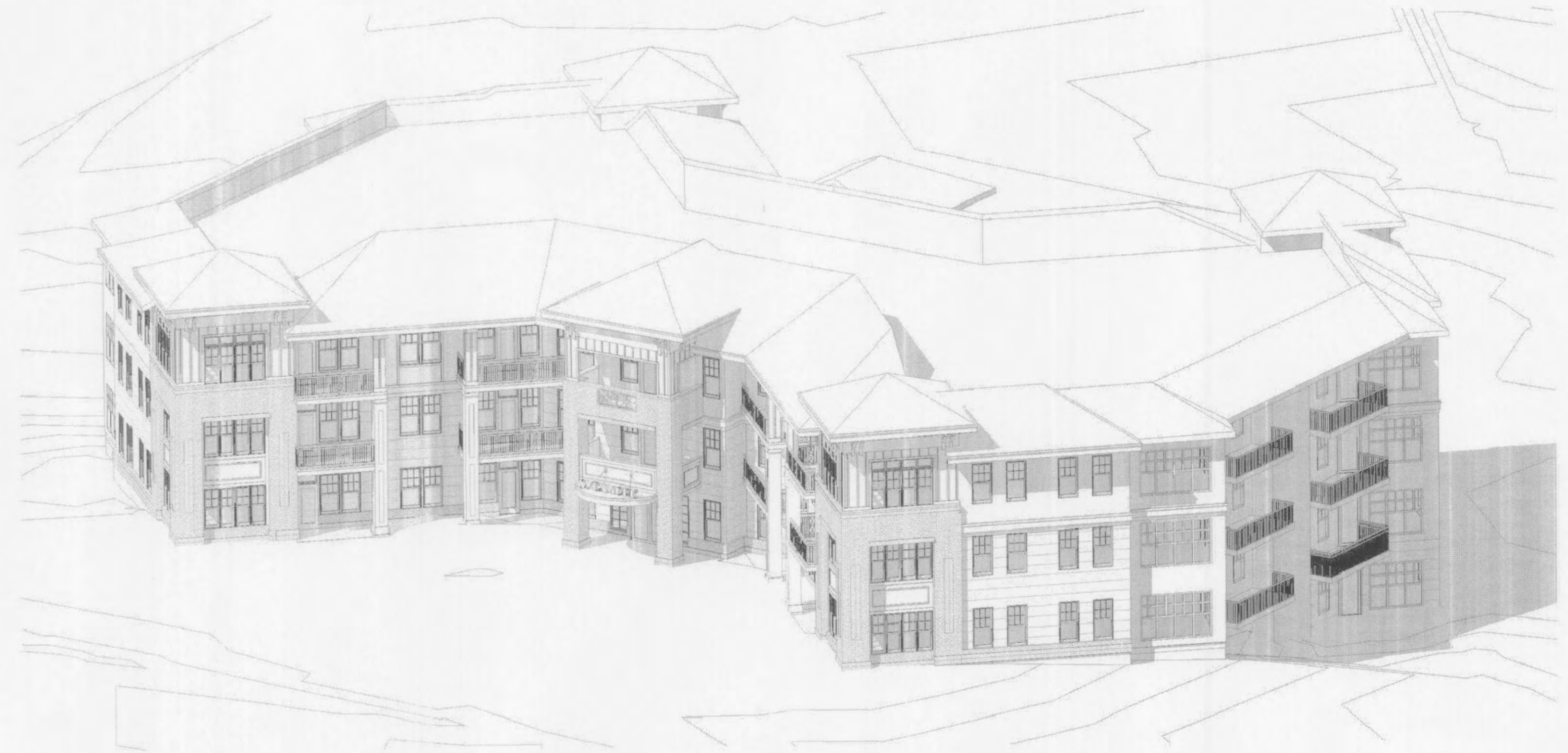
② Bird's Eye Perspective