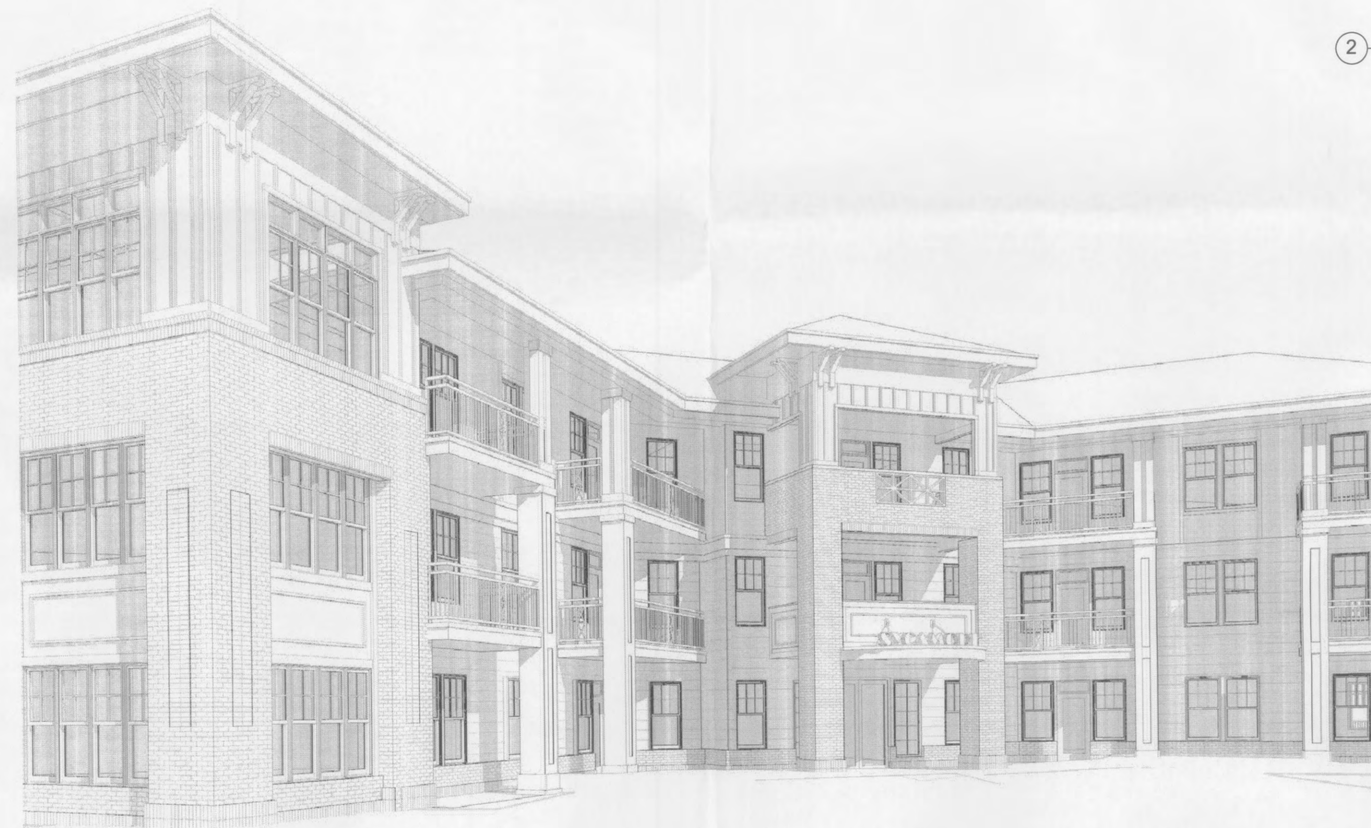
① Perspective of Lobby Entrance