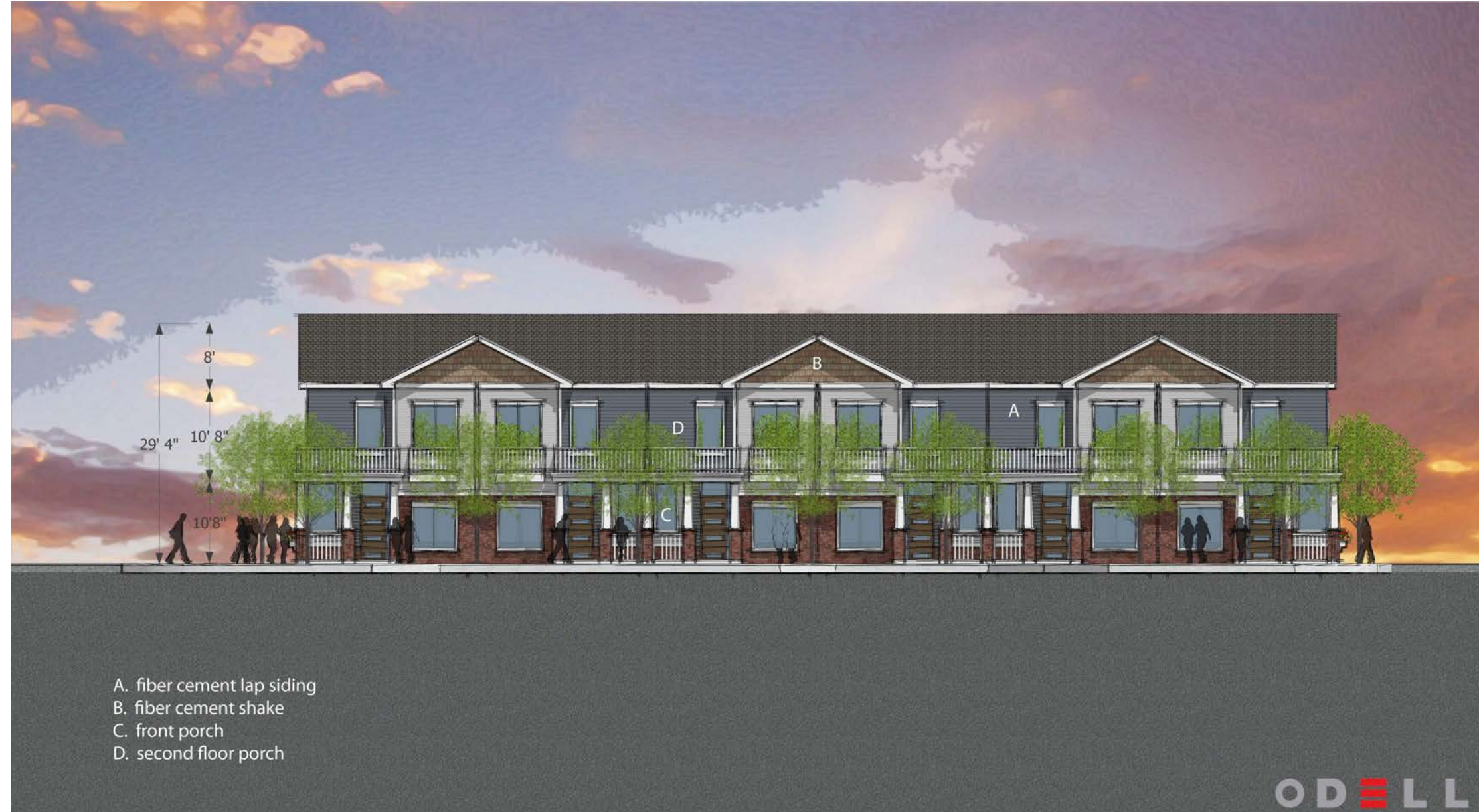
VIEW FROM VAN EVERY ST.

These renderings are provided to reflect the architectural style and quality of the buildings to be constructed on the Site. The actual buildings constructed on the Site may only have minor variations from these renderings that adhere to the general architectural concepts and intent illustrated is maintained.