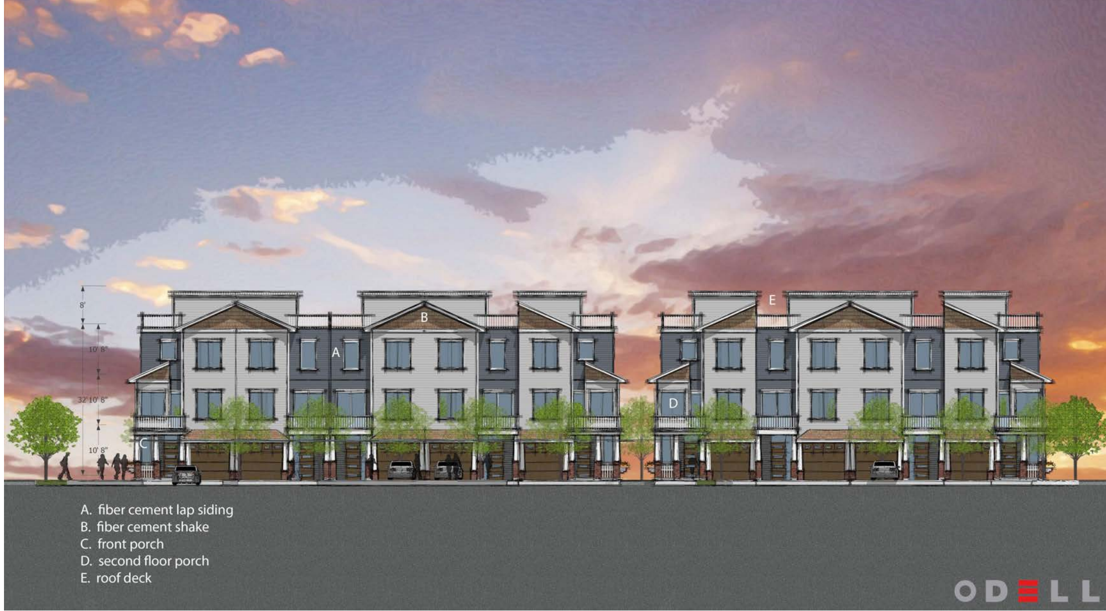
INTERNAL TOWNHOME ELEVATION