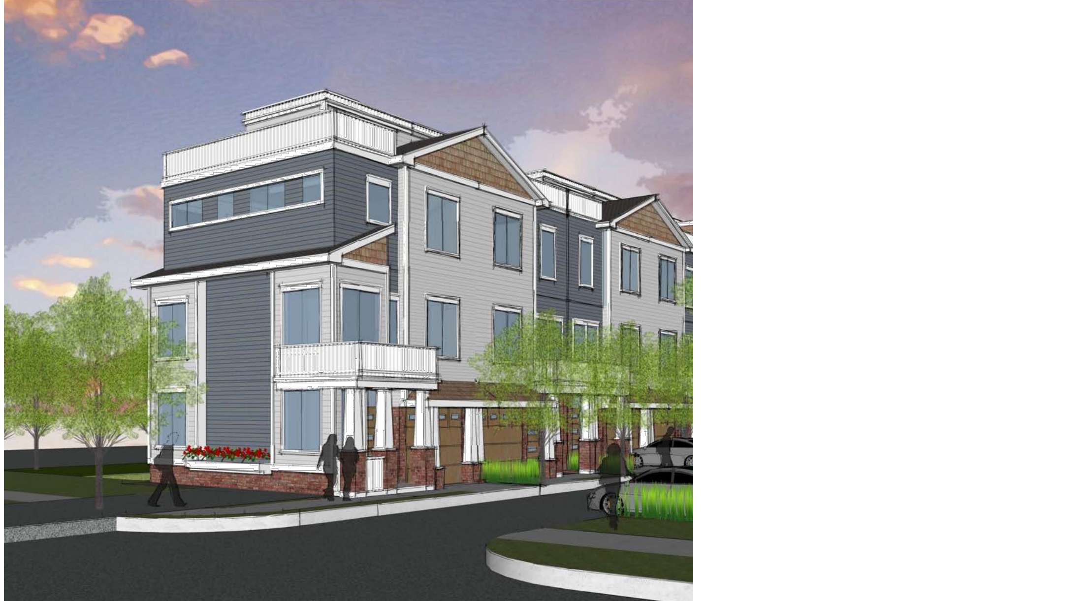
VIEW FROM HARRILL ST.