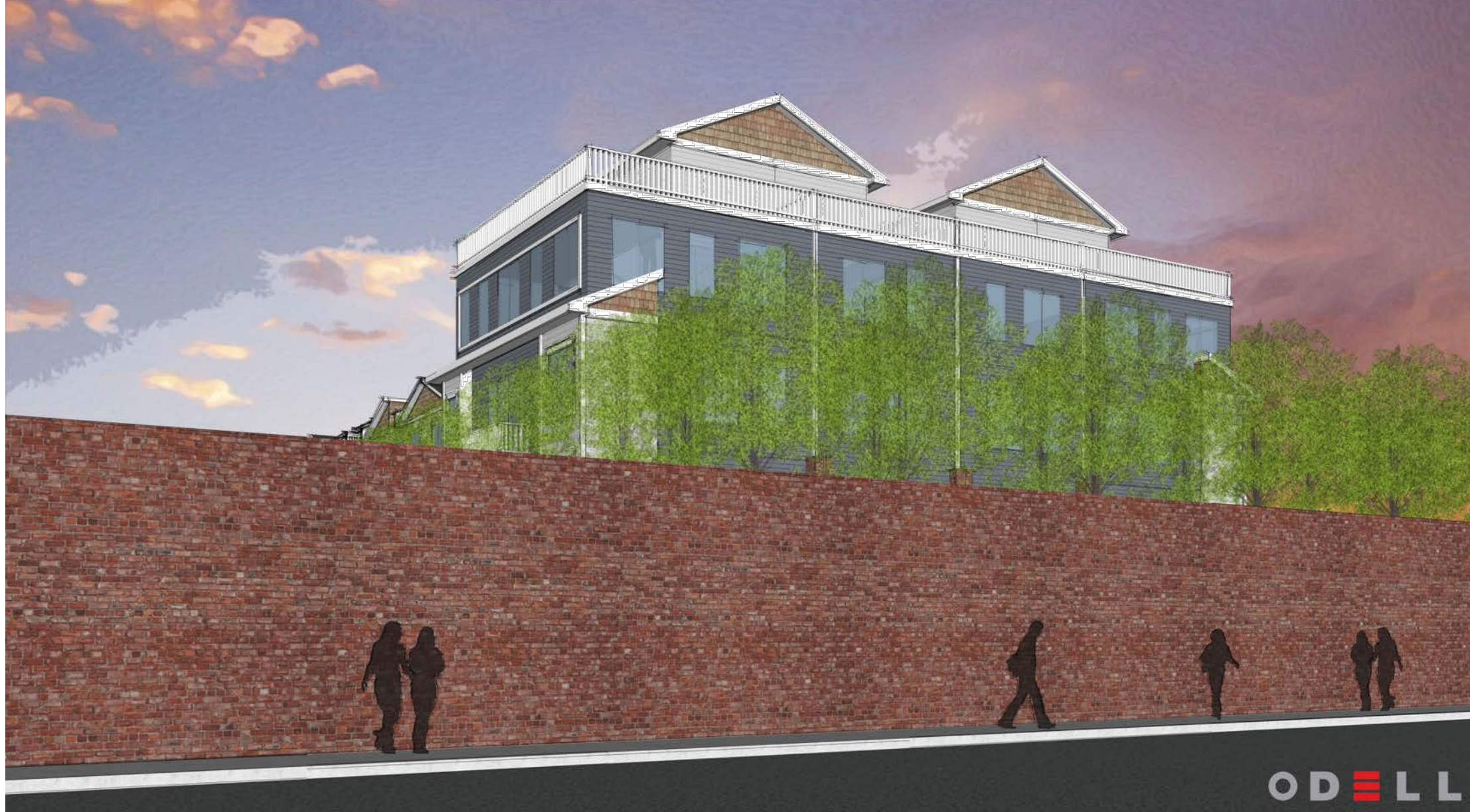
VIEW FROM SEIGLE AVE.