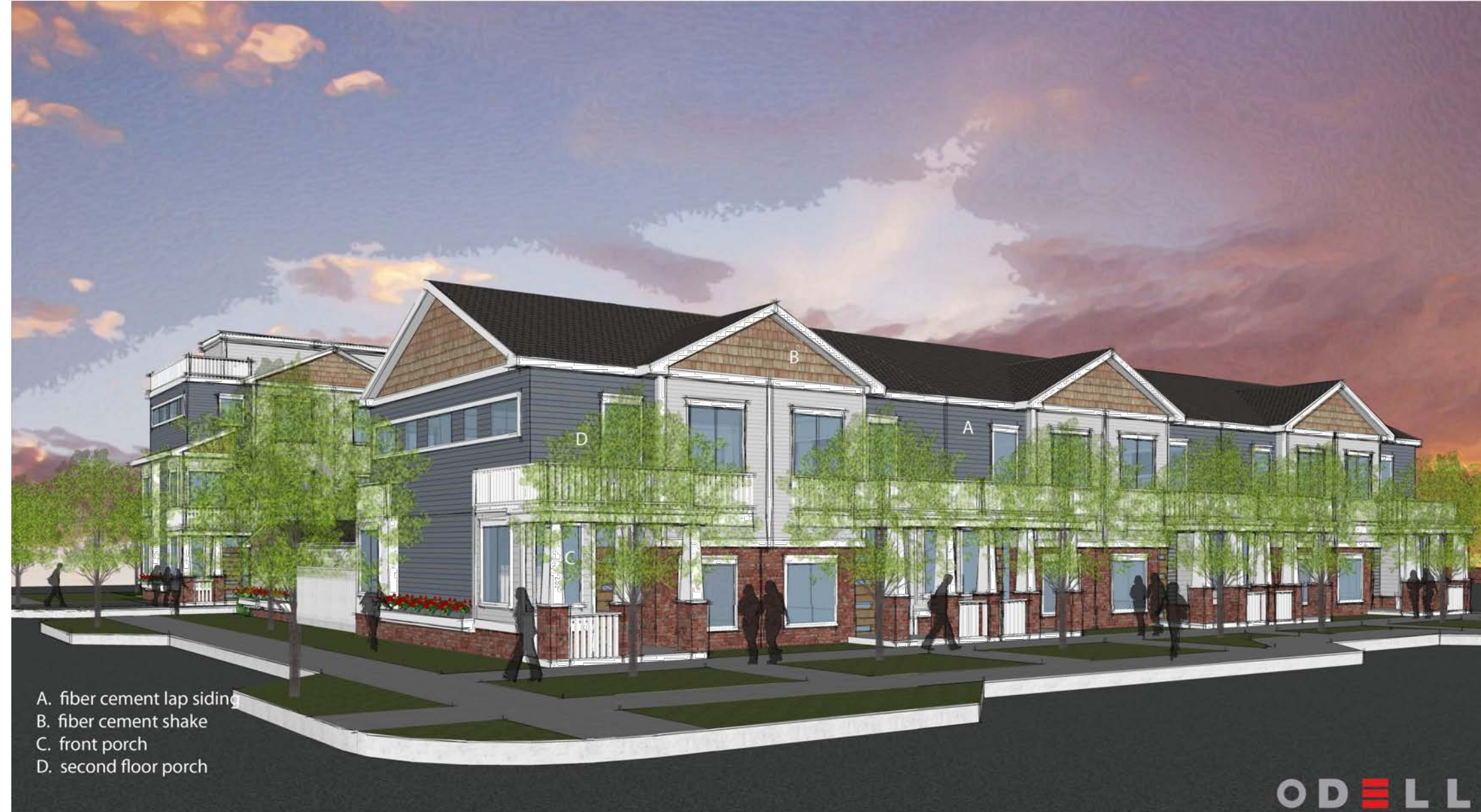
VIEW FROM VAN EVERY ST. & HARRILL ST.