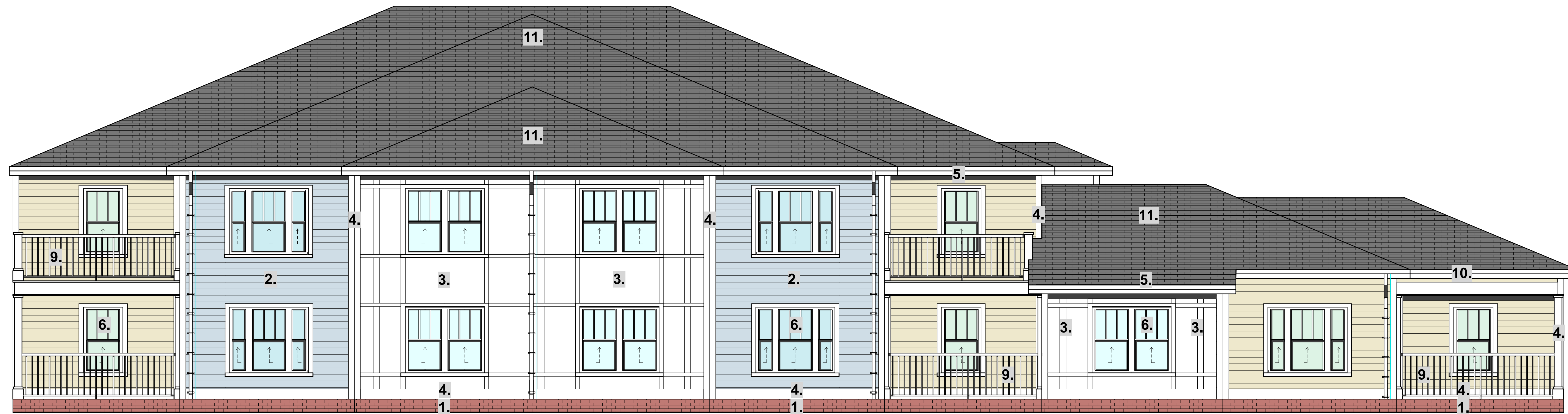
2 Multi-Family Building #6 Internal Parking Elevation Scale: 1/4" = 1'-0"

This Drawing is the property of Shook Kelley, Inc. and is not to be reproduced in whole or in part. It is to be used for the project and site specifically identified herein and is not to be used on any other project. This Drawing is to be returned upon the written request of Shook Kelley, Inc.