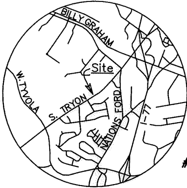
VICINITY MAP Not to Scale