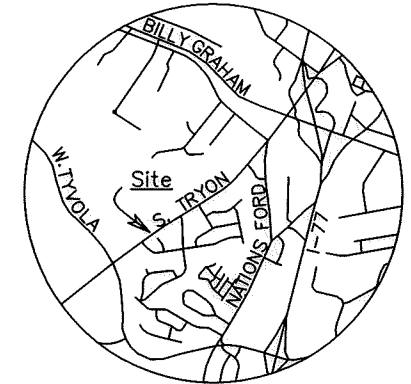
VICINITY MAP Not to Scale