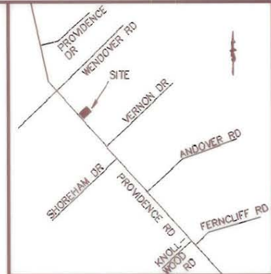
VICINITY MAP (N.T.S.)