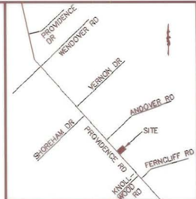
VICINITY MAP (N.T.S.)