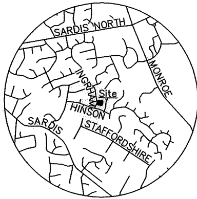
VICINITY MAP Not to Scale