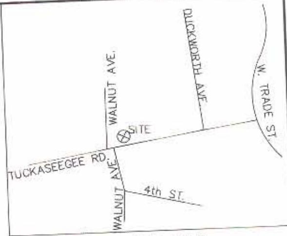
VICINITY MAP (not to scale)