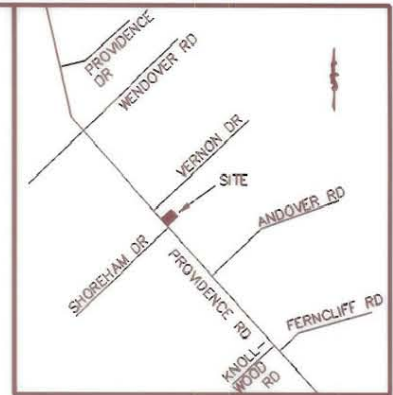
VICINITY MAP (N.T.S.)