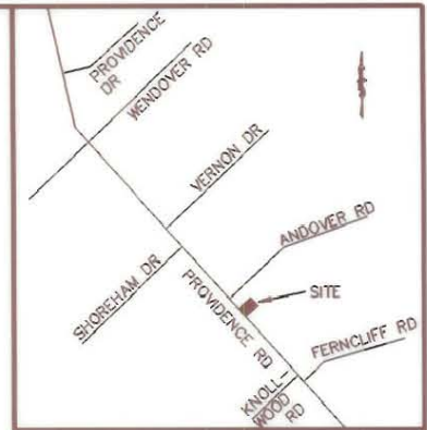
VICINITY MAP (N.T.S.)