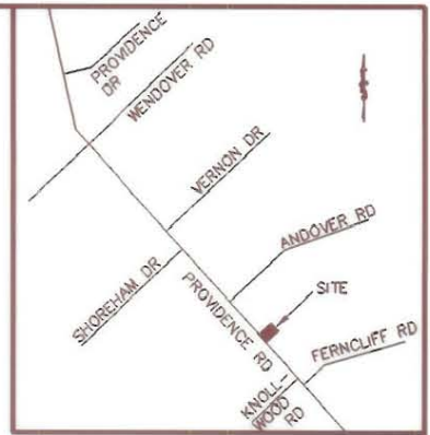
VICINITY MAP (N.T.S.)