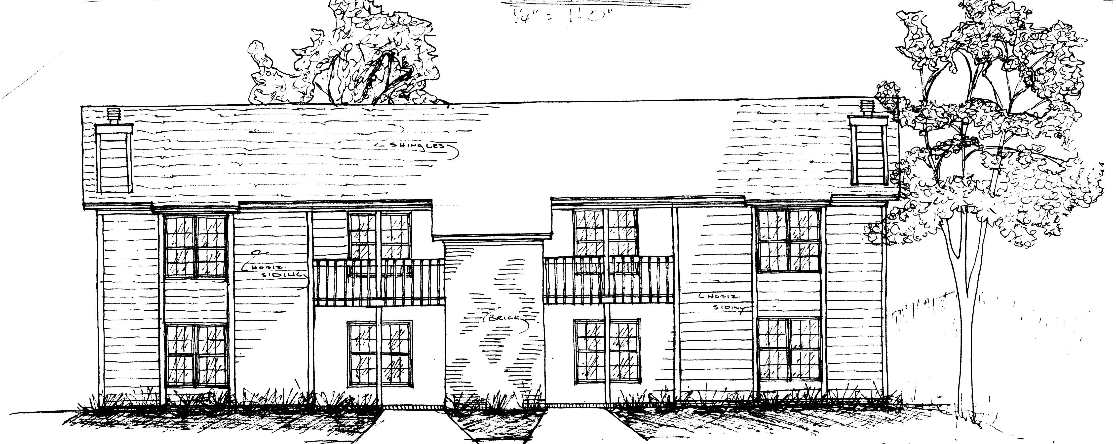
FRONT ELEVATION 1/4" = 1'-0"

DPR associates LANDSCAPE ARCHITECTS DESIGN · PLANNING · RESEARCH 704/332-1204 · 2036 E. SEVENTH STREET CHARLOTTE, NORTH CAROLINA 28204 SHEET NO OF