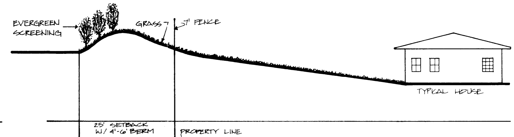
CROSS SECTION NOT TO SCALE