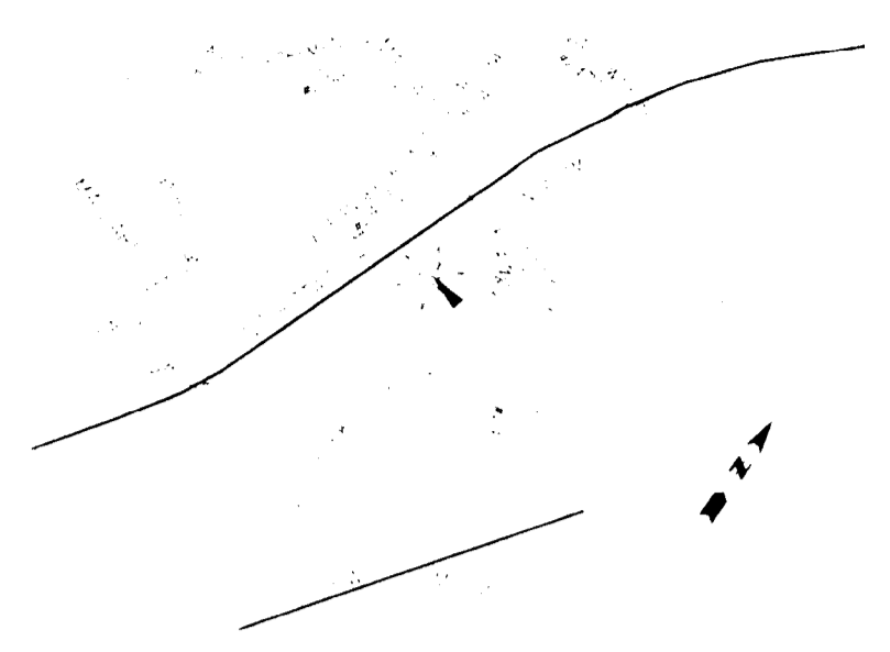
VICINITY MAP not to scale