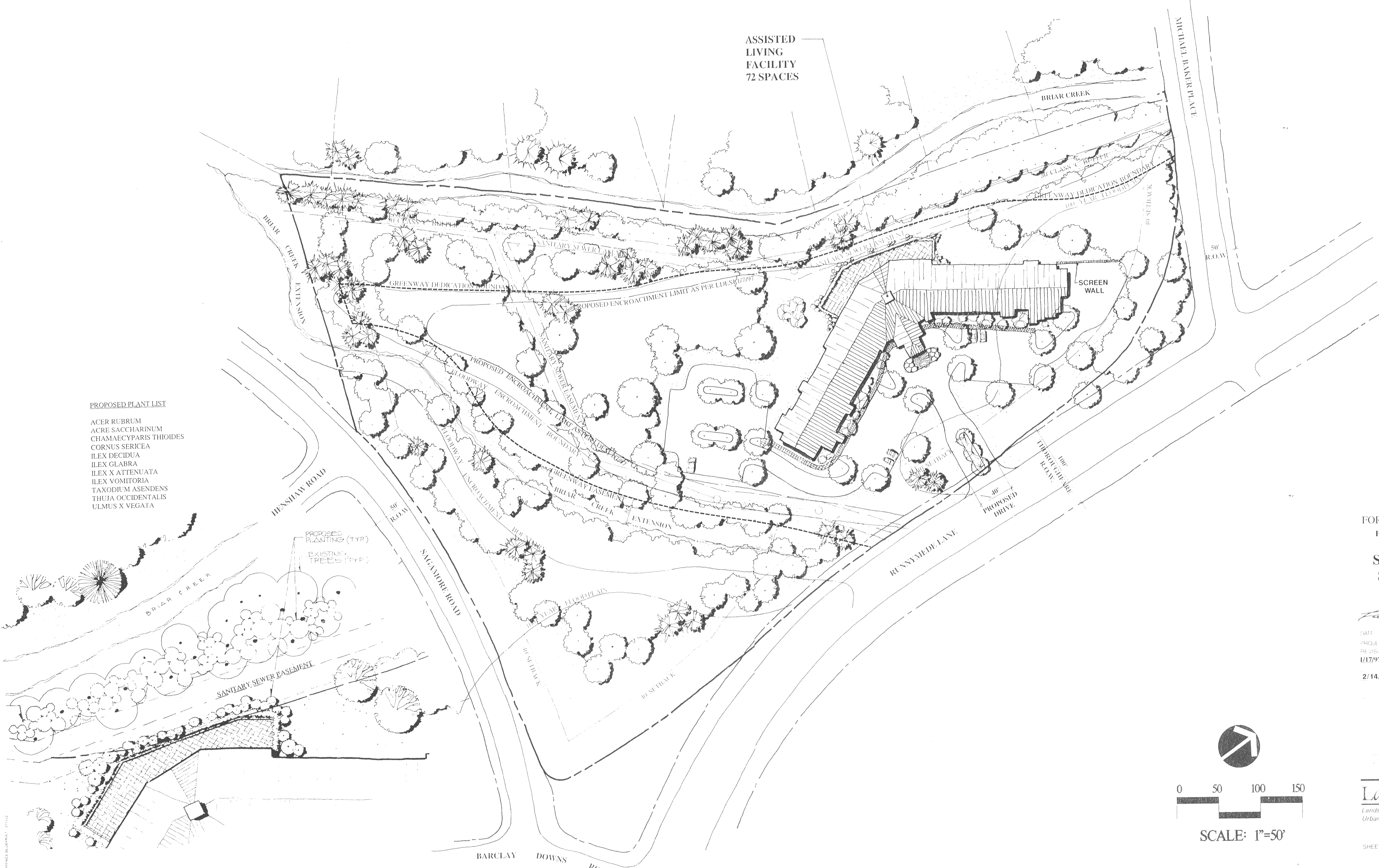
BUFFER PLANTING DETAIL SCALE: 1"=30'-0"