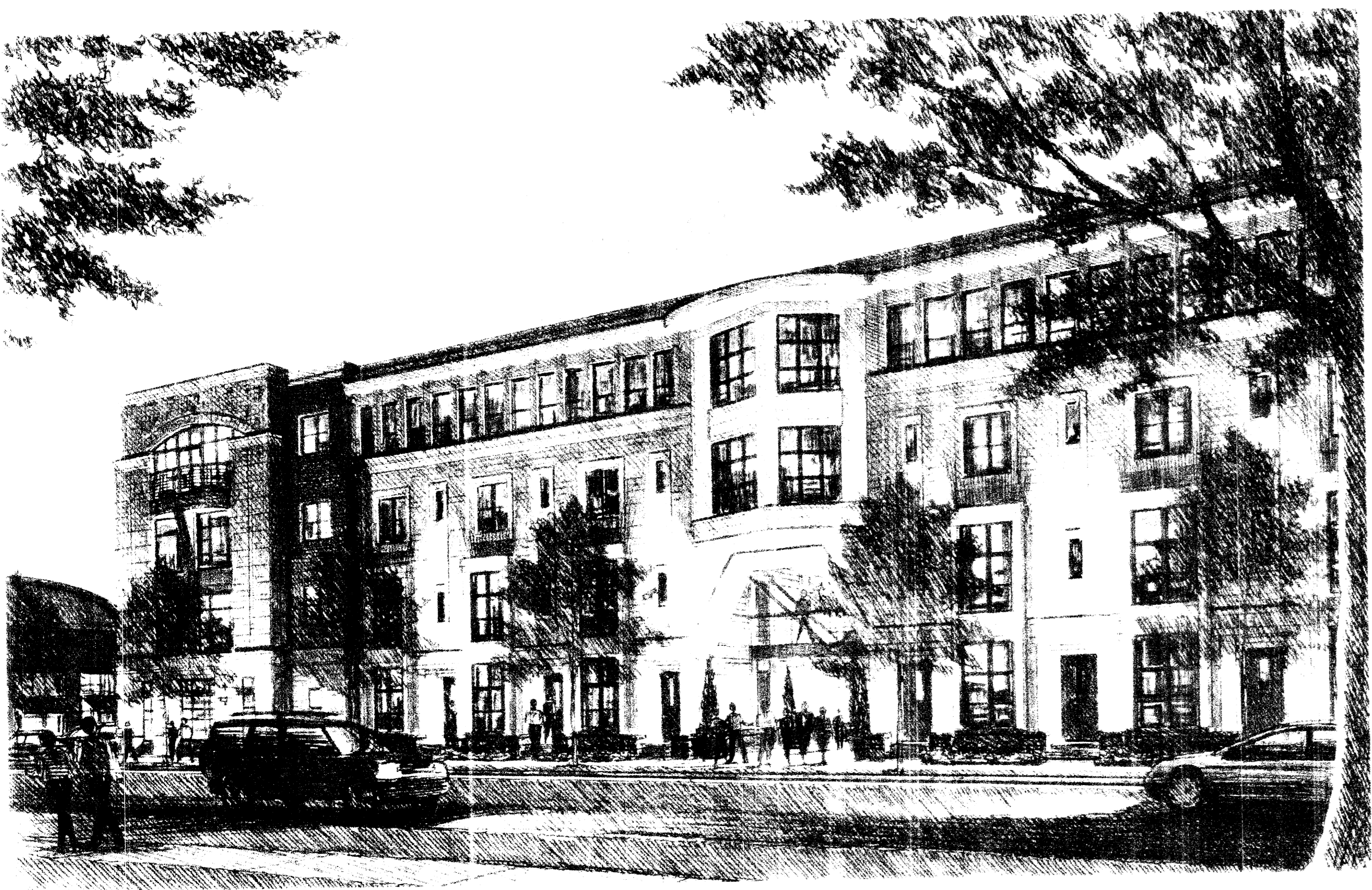
WALTON AVENUE RENDERING ARTS

A MIXED-USE DEVELOPMENT BY BOULEVARD CENTRO