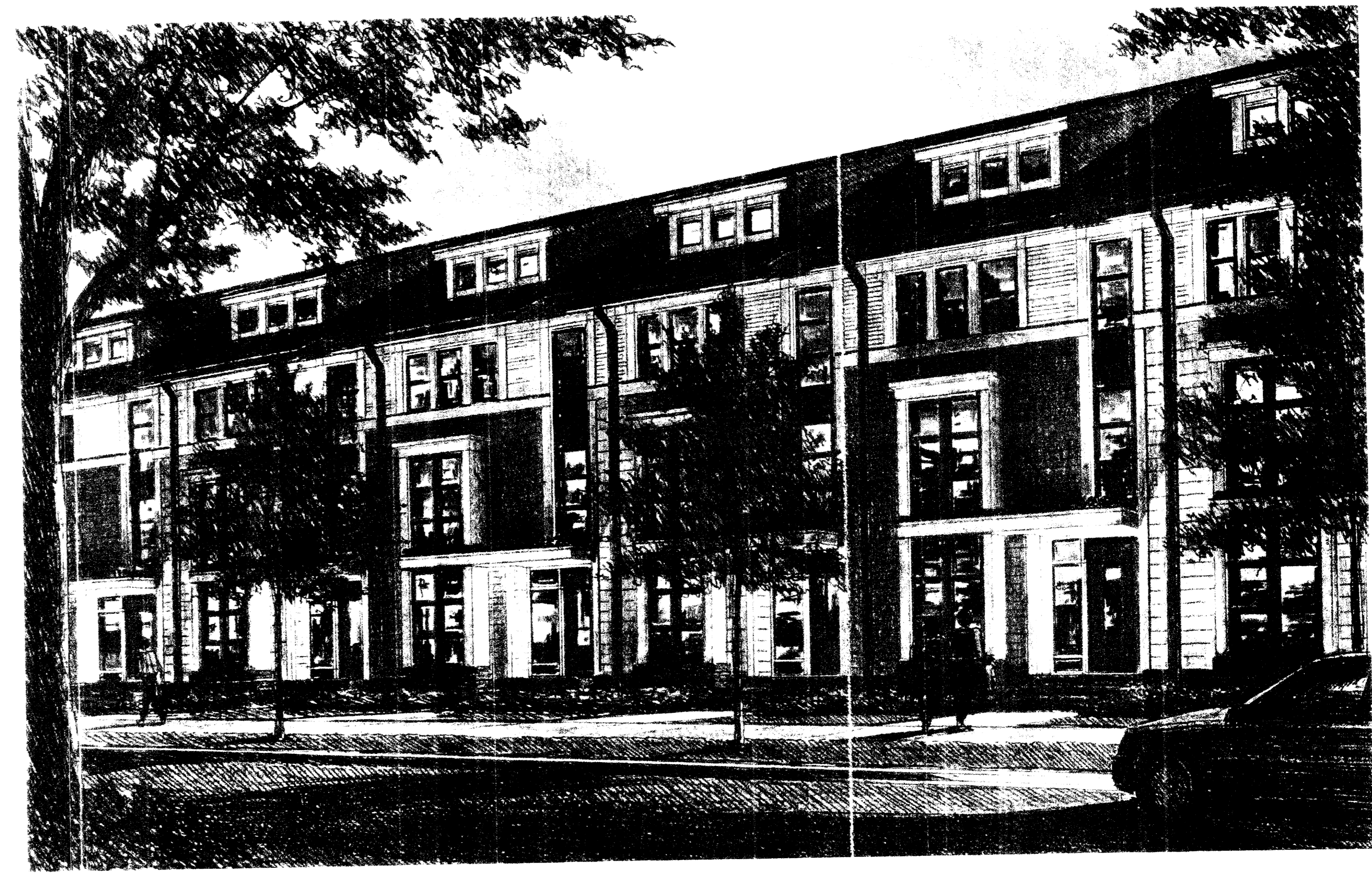
WALTON AVENUE RENDERING