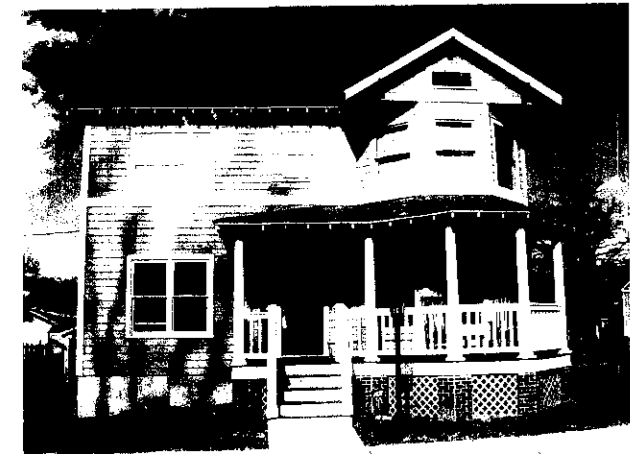
Example of proposed detached homes along Herrin Avenue.