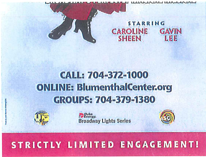
Example of advertisement on signage