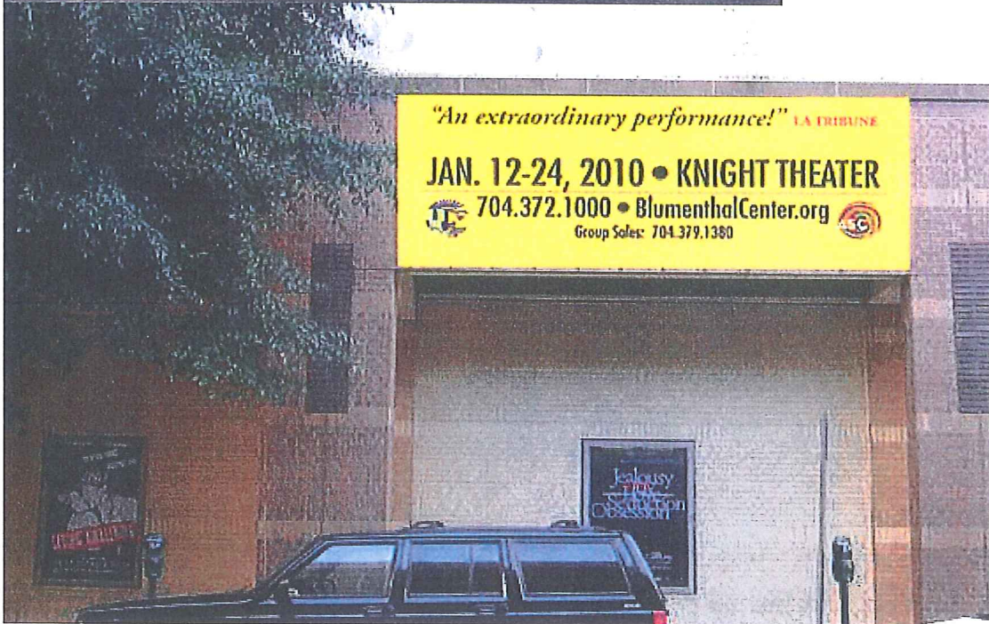
Example of banner