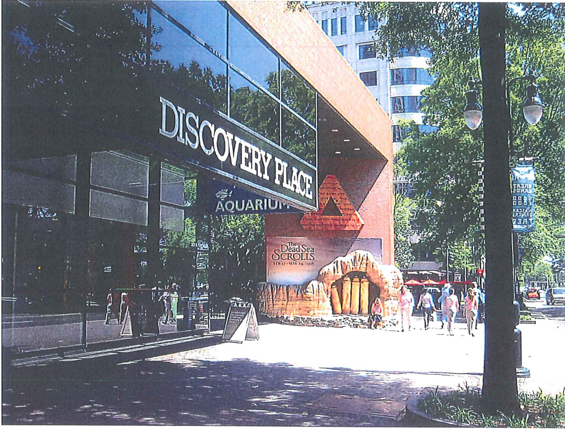
Example of wall signage