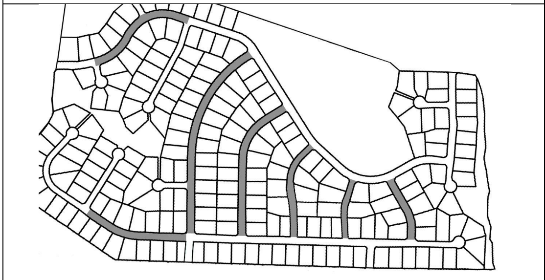
Figure 1 – Example of Streets Eligible for Block Averaging Calculation