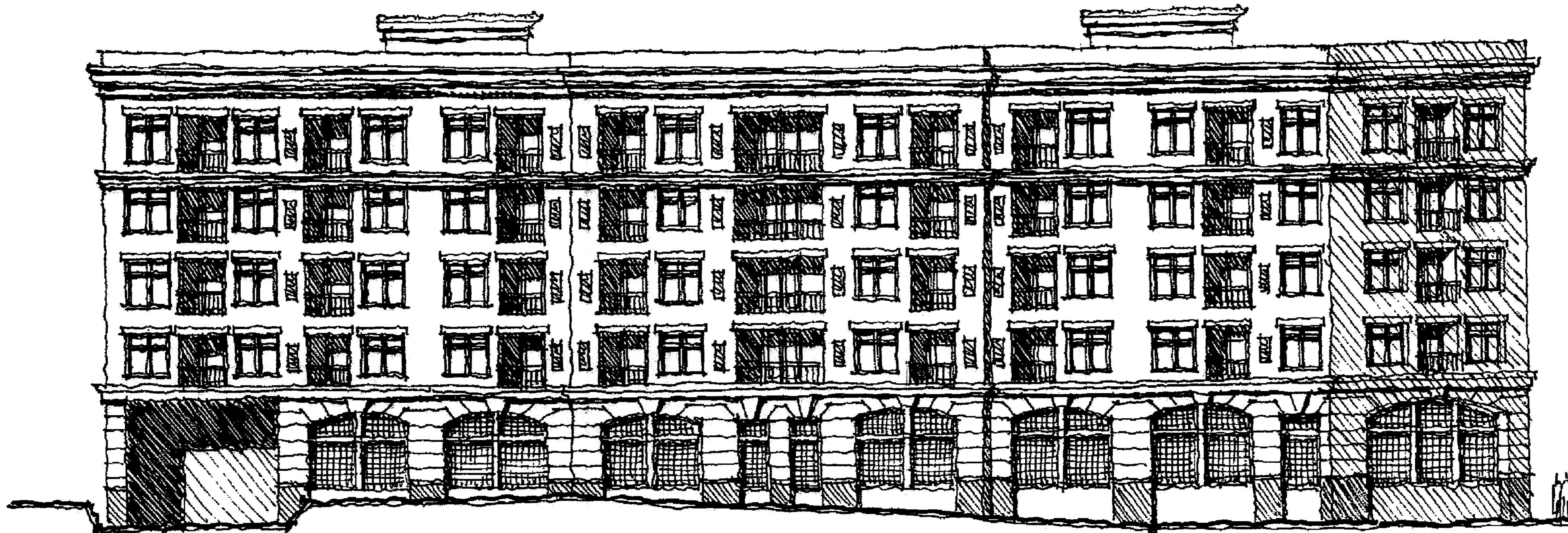
1 NORTH ELEVATION Scale: 1/8"=1'-0"