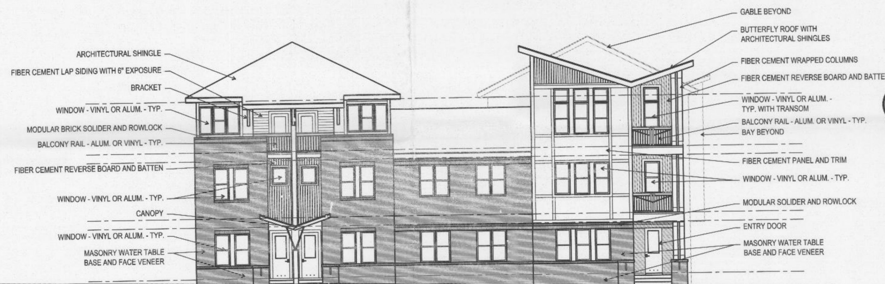
2 KENILWORTH AVENUE ELEVATION RZ.02 3/32" = 1'-0"