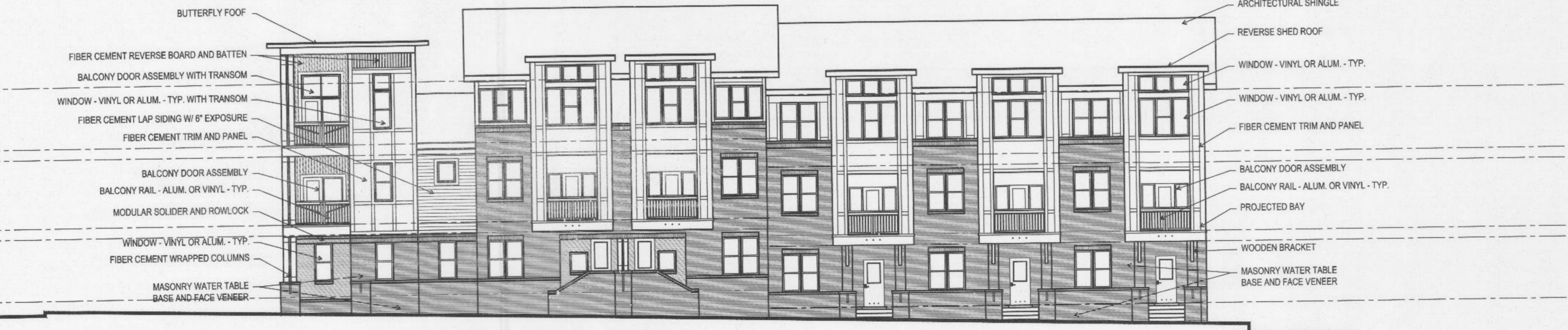
3 PIERCE STREET ELEVATION RZ.02 3/32" = 1'-0"