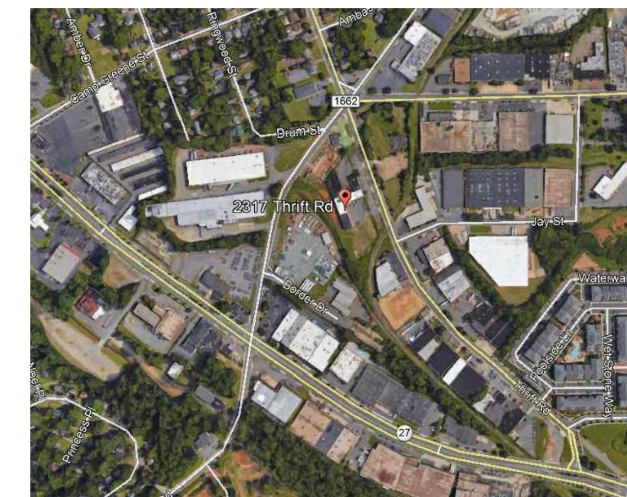
3 VICINITY MAP scale: NTS

Tax Parcel ID#: 07105114, 17105116 & 07105121 Total Site Acreage: 3.81 ACRES (166,155 SF) Existing Zoning: I-2 Proposed Zoning: MUDD-O Total Existing Building Area: 26,300 sf Open Space Required: 1,662 sf Min. Open Space Provided: 4,000 sf Proposed Additional Building Area: 12,000 sf Parking: As per MUDD requirements Tree Save Area: Approx. 10% of lot