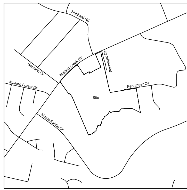
Vicinity Map Scale: 1" = 1,000'