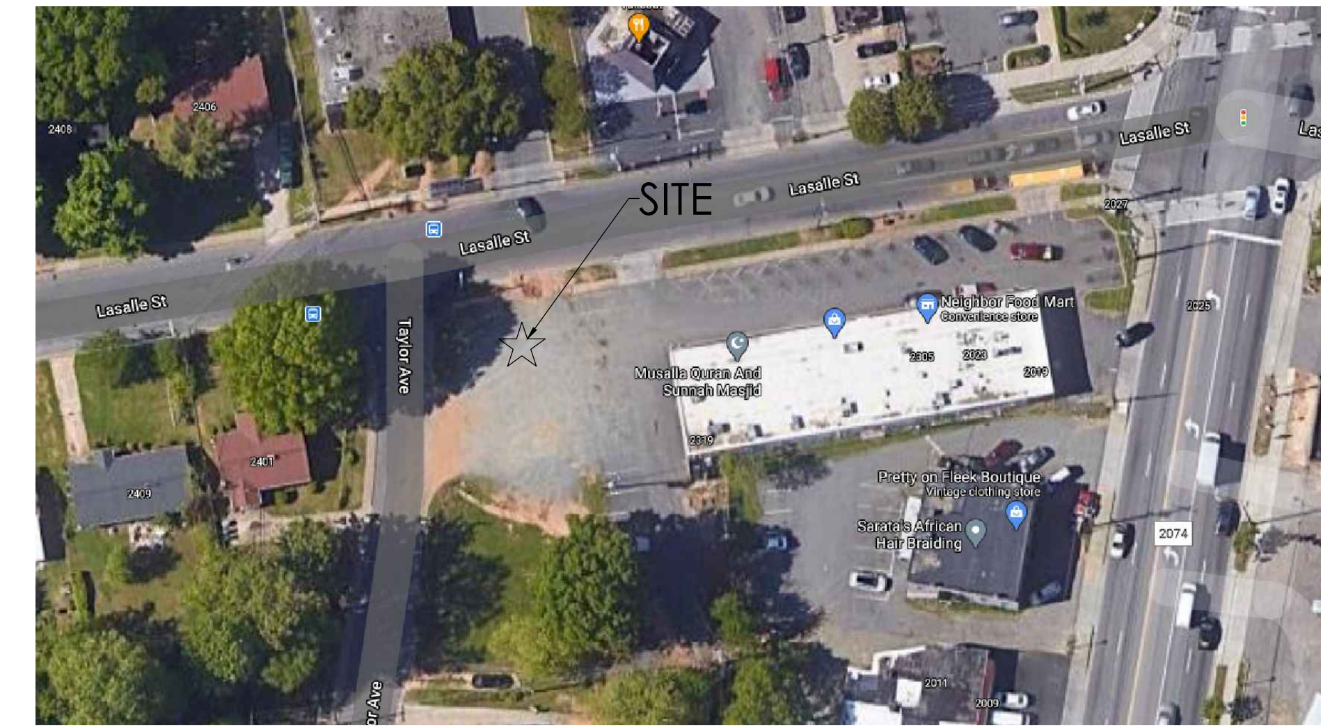
VICINITY MAP SCALE: N.T.S.

1. GENERAL PROVISIONS THESE DEVELOPMENT STANDARDS FORM PART OF THE REZONING PLAN ASSOCIATED WITH THE REZONING PETITION FILED BY E-FOX DEVELOPMENT CO. LLC (THE "PETITIONER") TO ACCOMMODATE THE DEVELOPMENT OF A PARKING FACILITY ON APPROXIMATELY 0.296-ACRE SITE, WHICH IS MORE PARTICULARLY DEPICTED ON THE REZONING PLAN (THE "SITE"). THE SITE IS COMPRISED OF TAX PARCEL NUMBERS 06912627, 06912601.